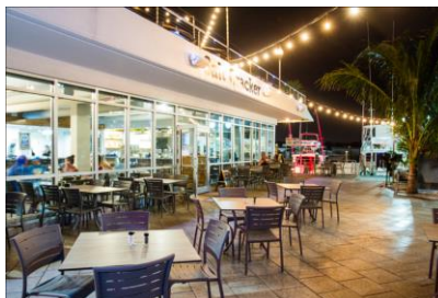
These are examples of outdoor seating allowed with social distancing.